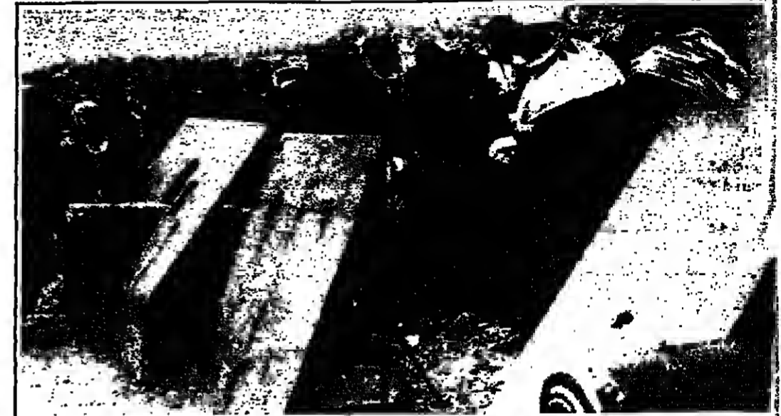
Prince Zaid Ibn Al Hussein, deputy commander of the Northern Arab Army and other regulars inspect an Austrian field gun captured from the Ottoman Turks during the battle of Fafleh on Jan. 25, 1917.